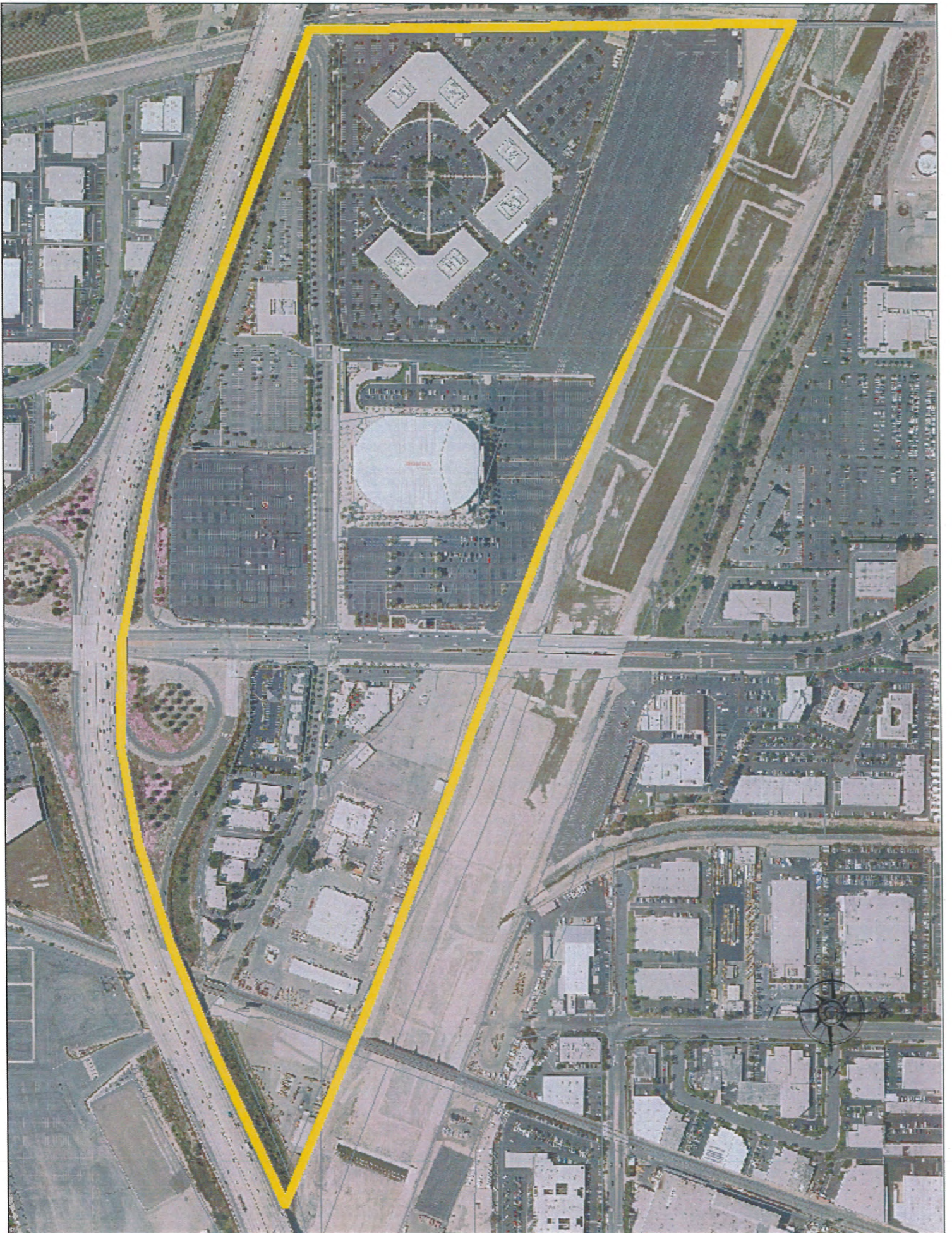
SCHEDULE C - TIER ONE PARKING AREA